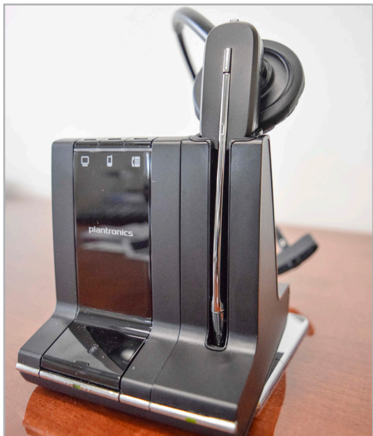
Photo: Plantronics wireless headset and base